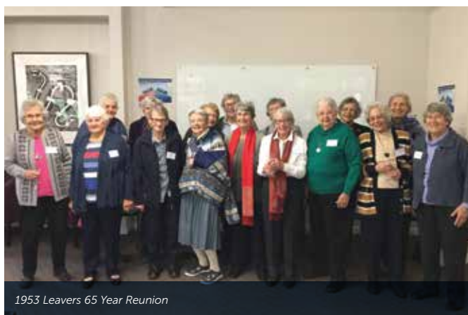
1953 Leavers 65 Year Reunion