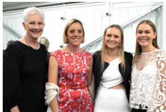
Read how the Pymble community came together to raise much needed funds for our farmers (page 17)