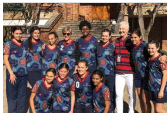
We hosted our Inaugural Indigenous Round of Sport in celebration of Indigenous culture (page 33)