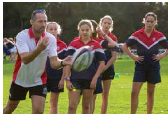
Read how more than 80 girls from Years 7 to 12 have opted to play competitive rugby (page 37)